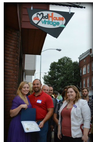
Mod House Vintage cut the ribbon in October.