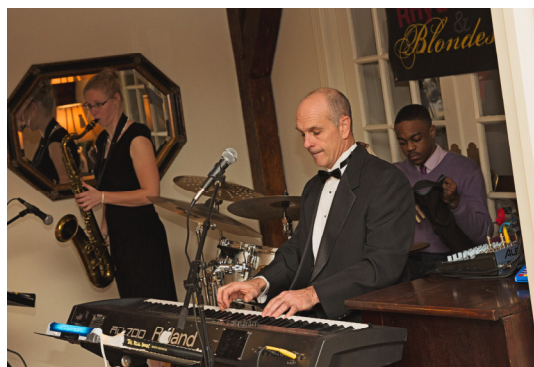
Rhythm and Blondes were a hit at the Annual Charity Gala.