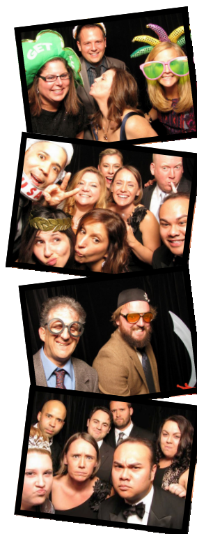
Guests enjoyed the Photo Booth favor, sponsored by the Phoenixville Jaycees.

For more pictures from the Gala and other events, turn to page 8.