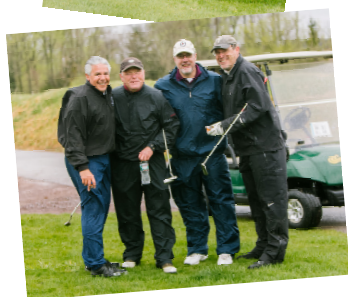
Golfers bundled up at the Golf Classic.